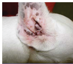
Photo shows inflammation within the ear canal.